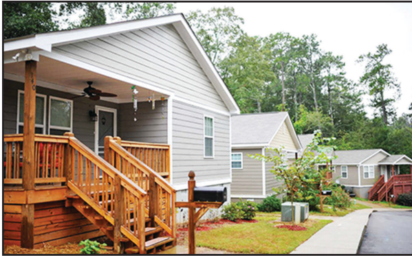
Carpenter's Circle subdivision, Athens, GA

AAHFH focuses on building multiple homes together, creating not just new houses, but new neighborhoods!