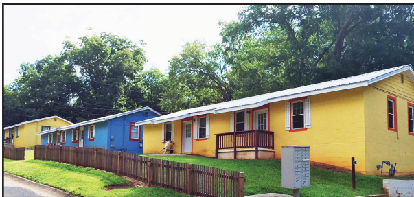
Simmons Street duplexes, Athens, GA

AAHFH serves more people by renovating existing multi-unit housing, and through programs aimed at restoring and adapting homes for folks with disabilities.