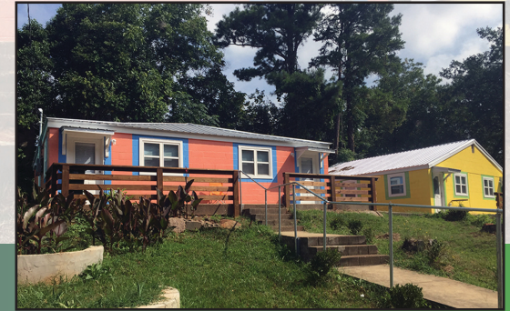
Completed homes on Magnolia Terrace

Once complete and fully occupied, these homes will constitute a community, a safe and affordable neighborhood where residents can enjoy peace and security and live fulfilling, productive lives.